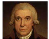
Thomas Newcome (1664-1729) "father of the Steam Engine"

A series of industrial developments started with the first steam engine a condenser boiler patented in 1698 by Thomas Savoury. Developments followed, first came the introduction of a piston in 1710 with John Cowley and Thomas Newcomen's Stationary Steam Engine patented in 1712. This Atmospheric Engine became the first commercial true steam engine used for pumping in mines. Next came the James Watt Rotary Powered Steam Engine which had a separate condenser in 1769, the basis of all modern types.