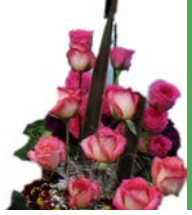
Flower Arranging Group