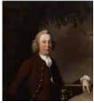
James Brindley 1716 - 1772