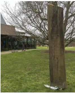
Yehudi Menuhin monument near the hall